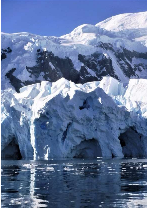
Paradise Bay, Antarctica