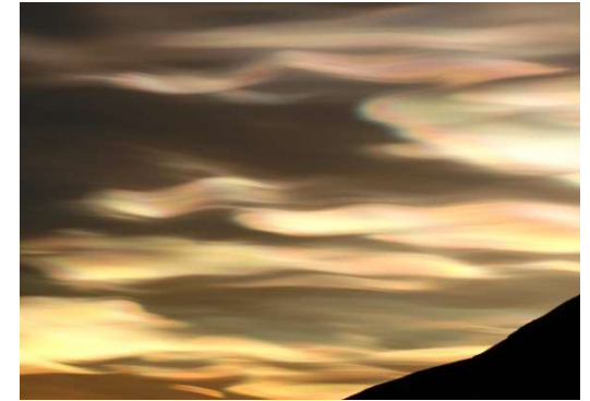
Nacreous Clouds, Ross Island, Antarctica