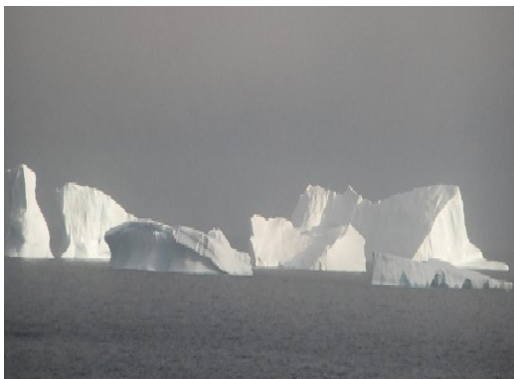
Icebergs in Marguerite Bay, Antarctica